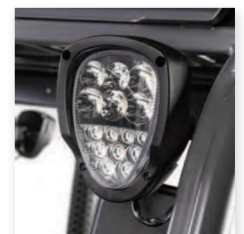
Floor Spotlights (optional)